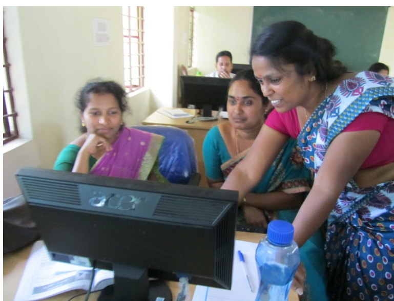
Karnataka STF MRP workshop, Bengaluru South DIET, 2013

The PLC program begins with the design and conducting of the workshops to create RPs for each subject area (Mathematics, Science, Social Science, Language etc.). These workshops would need to be facilitated by faculty / experts identified by the department. These workshops would be typically conducted in ICT Labs set-up at the state capital / head quarters. The agenda would include enrolling the participants in the state-wide PLCs. The participants would continue their interactions on these virtual networks.