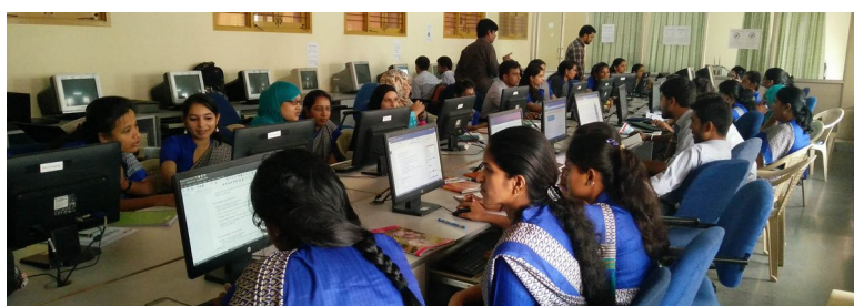
VTC Course for student teachers - Technology Integrated Learning, offered in blended mode

Once the teachers have been enrolled into the PLC program and made comfortable using ICT, they can become candidates to offer blended learning or e-learning programs to. (Many institutions are offering MOOC, without preparing the entire teacher population to become digitally literate, such efforts are likely to be premature and hence fail. Once teachers become digitally literate, courses can be designed and offered to them by SCERT.